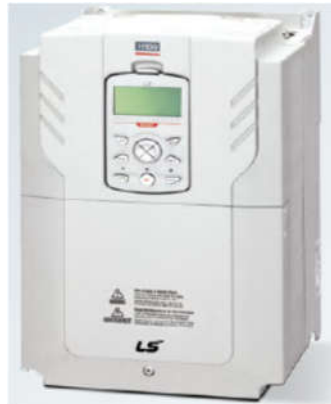
Built-in Dynamic braking transistor, EMC Filter(C3)